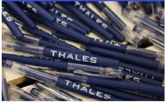
Pens: £2,800* Get your branding on the pens given out at the conference, available for all attendees

Notebooks: £3,400* Get your branding on the notebooks given out at the conference, a reusable item with a long lasting brand impact